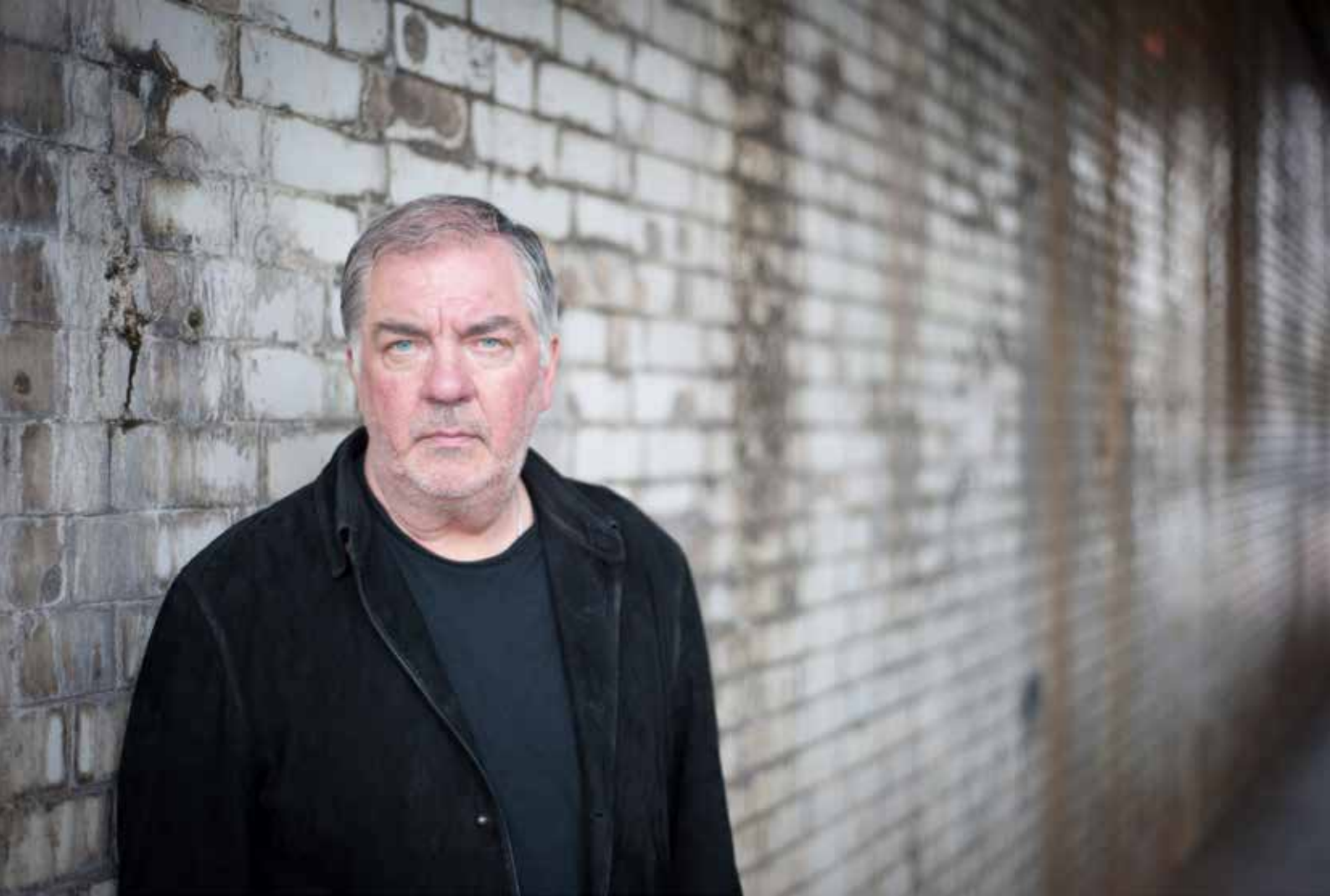
Kevin Cummins Photographer © Kevin Cummins 2015

“When you’re freelance, you need all the support you can get. It’s especially hard when you’re young and starting out. Knowing there’s somebody out there like DACS, who is prepared to work on your behalf is reassuring.”