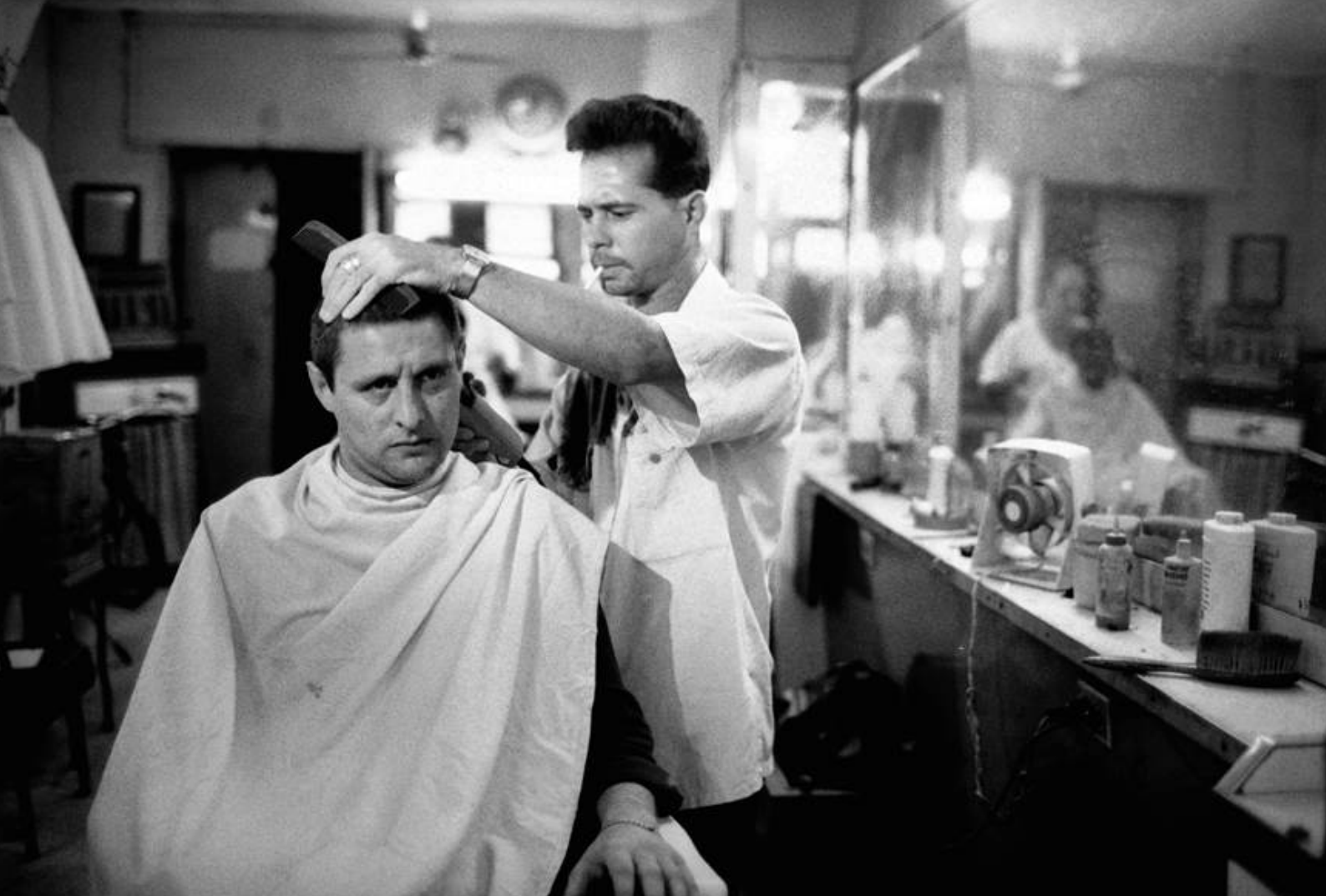
Shaun Ryder – Black Grape . Havana 1996.