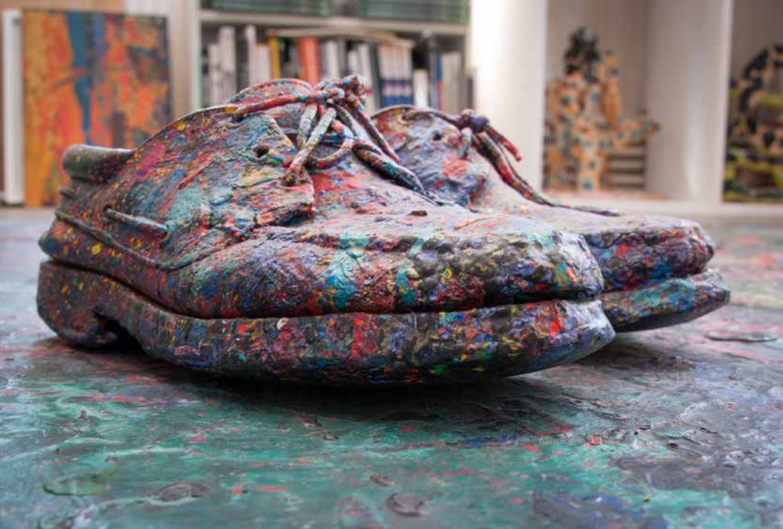
John Hoyland's studio